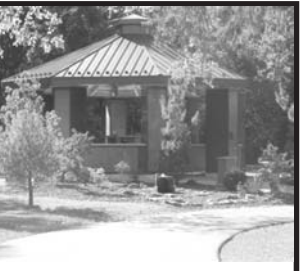
Plan today, for peace of mind tomorrow

Meeting 1st Thursday of Each Month a 683 McEwan Ave. Call 519.981.7895 Special thanks to Blak's Baker